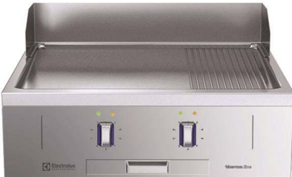
588539 (MBHOBBHOAO) Electric Fry Top with smooth and ribbed chrome Plate, one-side operated with backsplash